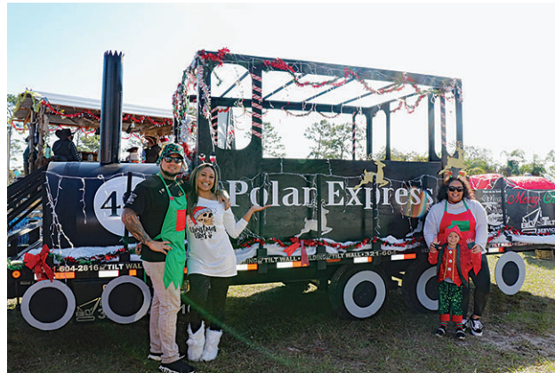
2nd Place Creativity - Tilt Time Services, LLC