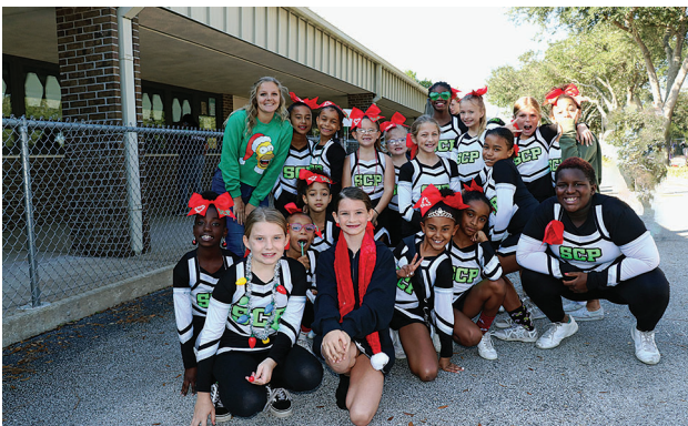
2nd Place Musical - Space Coast Panthers