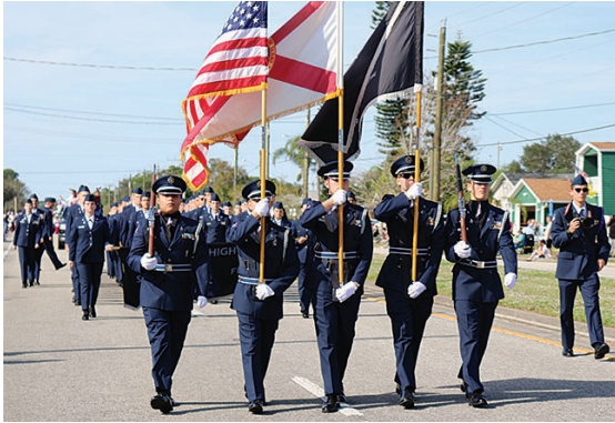
Space Force JROTC Honor Guard