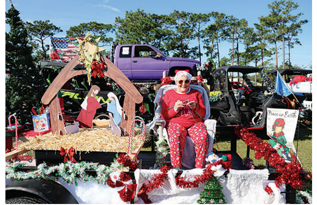
2nd Place Spirit - KSK Junk Removal