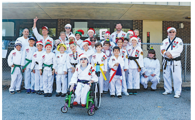
2nd Place Marching Non-Musical Port St. John Blackbelt Academy