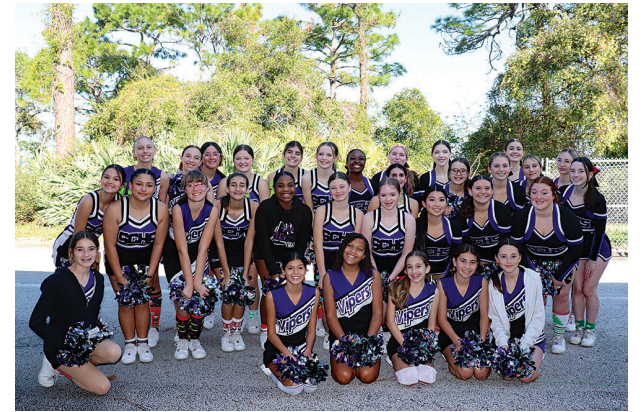
1st Place Marching Non-Musical: SC Vipers Cheerleaders