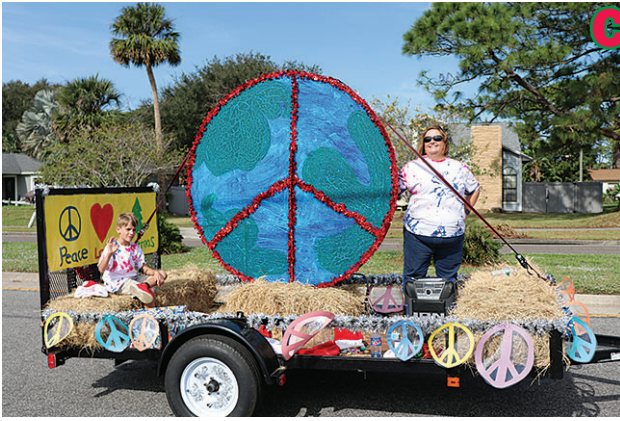
1st Place Theme - Challenger 7 Elementary