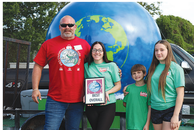
Best Overall - Higginbotham Cleaning Service