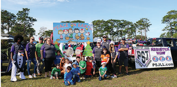
2nd Place Theme - PSJ Little League