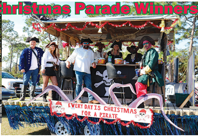
1st Place Creativity - PSJ Pirate Bar