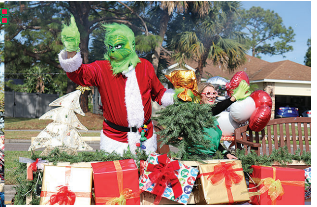
1st Place Spirit - Parrish Healthcare