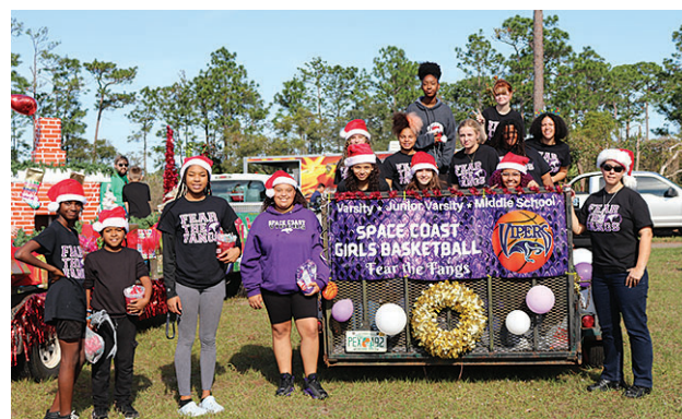
Lady Vipers Basketball Team